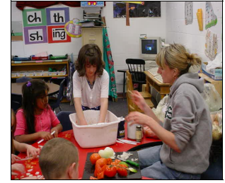
Mixing up the salsa