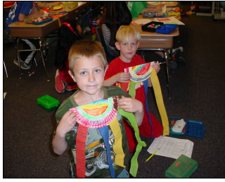
Shaking our Maracas