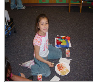
Enjoying the salsa..Seconds?

On Monday, May 5 th , the first graders got together and talked about Cinco de Mayo and its history. Following the discussion, the students made colorful maracas, did some activity pages, and made homemade salsa. A huge thank you to everyone who sent in the needed ingredients, as everyone got to cut up their own onion, tomato, and lime! After the chefs were done, it was time to eat! Mmmm, Mmmm, good!